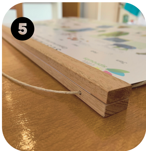
5 Repeat step 4 for the top frame. Place the wood piece with the string on the underside of the poster.