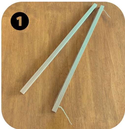
1 Take your frame out of the packaging. Keep each pair of wood together as they are perfectly aligned.

Note: If you hold the magnets the wrong way, they will repel each other. Adjust the wood pieces so magnets attract.