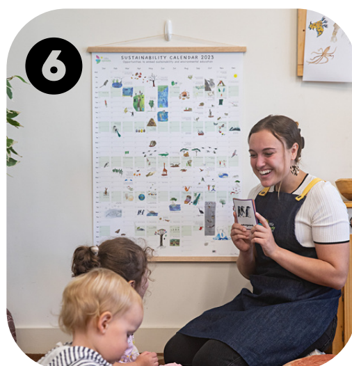
6 Hang the string on a hook or nail to display your print.