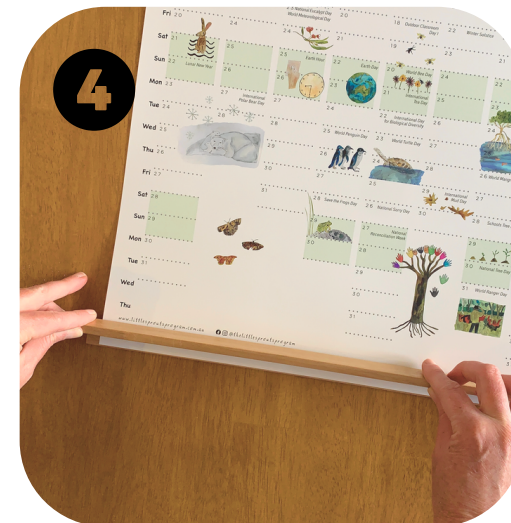
4 Carefully place one edge of the top piece of wood down, remove fingers from in between wood pieces, and gently drop down until it 'clicks' with the bottom piece.