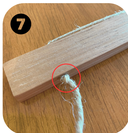
7 If you need to adjust the height of the hanging string, lay the poster and frame on a flat surface, undo one knot on the string, adjust, then re-tie.