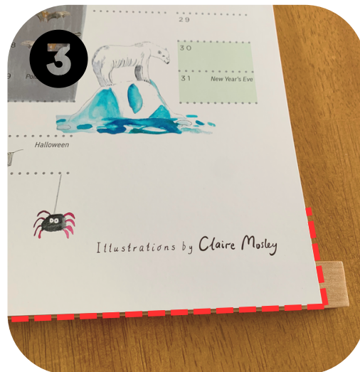
3 Line up one piece of wood behind the bottom of the poster. There will be a slight overhang of wood on each edge. Hold the poster in place with your fingers.