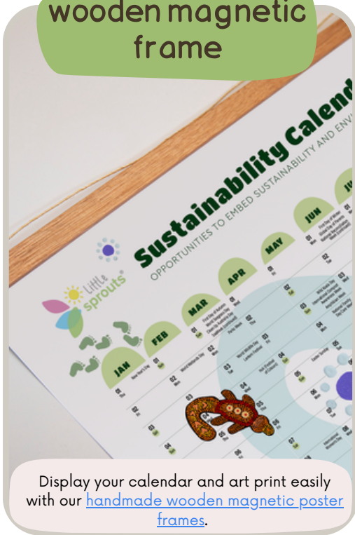
01 wooden magnetic frame