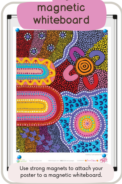
03 magnetic whiteboard